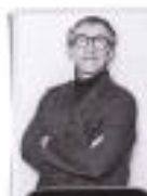
JASPER CONRAN, designer

'Stranded on a desert island I would love to create a personal, cosy environment using all of the natural elements at hand. At night, I would transform the space into a magical oasis using Dan Flavin's neon light sculptures. I imagine coloured neon light tubes hanging from the branches of a huge tree, like a futuristic wind chime.'