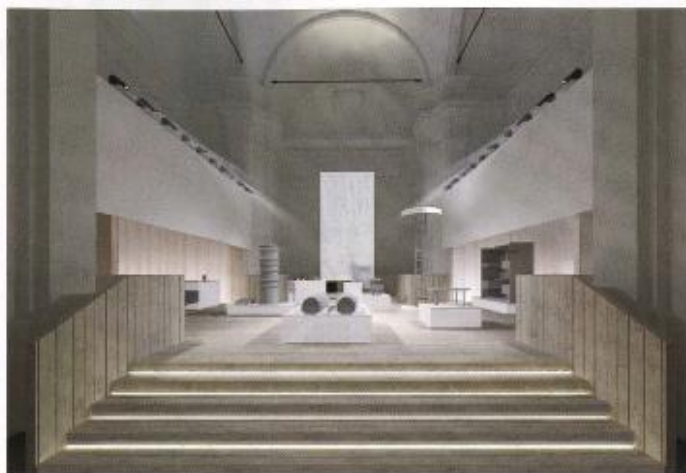
A RENDERING OF OUR HOLY HANDMADE! TEMPLE OF DIVINE DESIGN, OPEN AT MILAN'S MEDIATECA SANTA TERESA DURING SALONE DEL MOBILE. COME CONFESS BEHIND THE BOURROULLECS' SACRED VEIL OR CLIMB SNOHETTA'S STAIRWAY TO HEAVEN